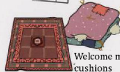
Welcome mats, cushions

Eggshells, tea leaves, paper cups, washing liquid containers, Styrofoam, waxy paper, boots, leather goods, aluminum foil, cassette tapes, drying agents, disposable lighters, cat litter, helmets, disposable heat patches, shells, clothes and fabric, etc.