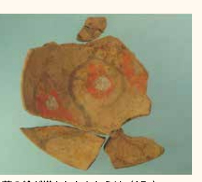
花の絵が描かれたかわらけ (15c) 15th century earthenware cup with drawing of flower