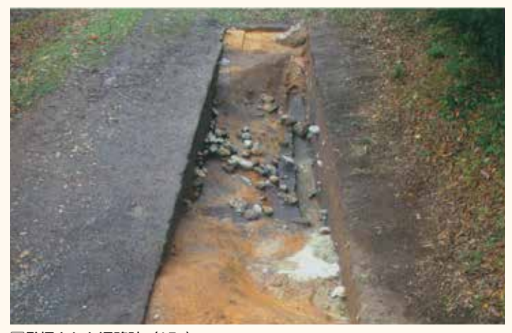
B発掘された通路跡(15c) Excavated entrance

In the 15th century, this area was levelled to form the main compound. It was protected by earthen embankments on the north and west sides, as well as a cliff and a moat. The huge stone on the east side of the level area marks the site of the original entrance.