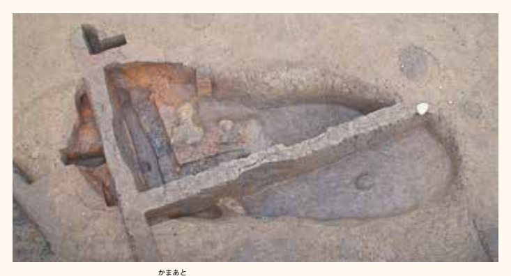
E発掘されたかわらけ窯跡(12c) Excavated Kawarake (earthenware cups)kiln

The 12th century remains, such as the remains of L-shaped building pillars dug into the ground, wells, handicraft production for steel, pottery, tools used to forge bronze and other metals, the road that stretches to the Kitakamigawa River, and structures thought to be religious facilities, are all deployed in the lowlands. These structures were maintained even after the downfall of the Oshu Fujiwara family without interruption, and managed in the lowlands until the middle of the 14th century with relocations of central areas. The majority of the ruins were moved into the hilly areas in the mid-14th century, where they functioned as a medieval castle until the middle of the 15th century.