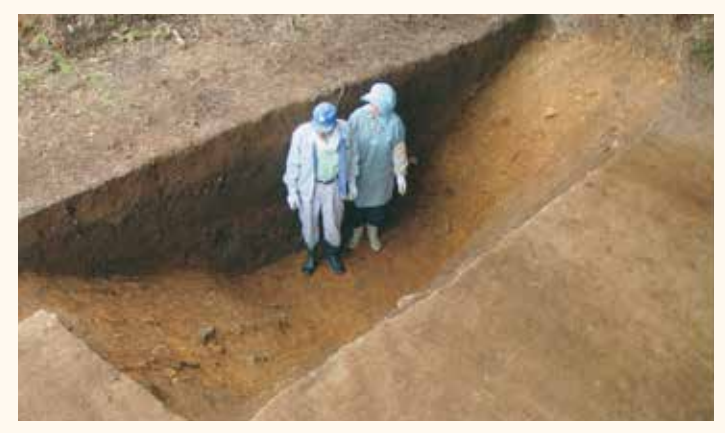
C発掘された堀跡(15c) Excavated moat

The remains of the moat partially surrounding the Kuruwa I (first compound of fort) and the Kuruwa I (second compound of fort) are now mostly buried, but in the 15th century the moat was 6m wide and 2m deep.